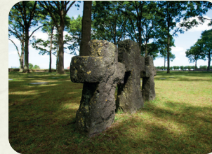
📍 The German cemetery in Langemark