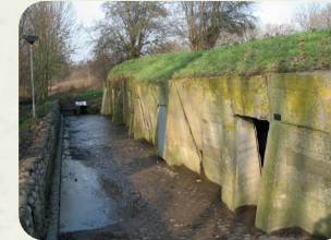
📍 Site John McCrae