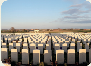
📍 Tyne Cot Cemetery, Passchendaele