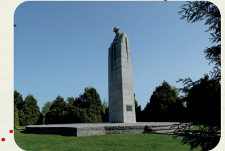
📍 Monuments to all the British Forces, incl. ANZAC and Canadian