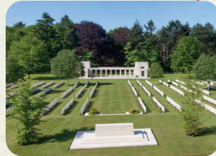
📍 Polygon Wood, Memorial to 5 th Australian Division