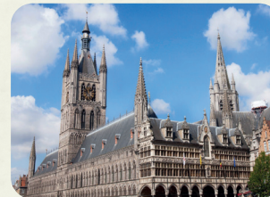
📍 Ypres (Wipers)