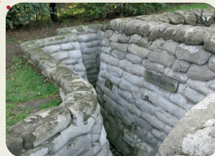
📍 Reconstructed trench