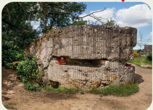
📍 Preserved battlefield of Hill 60