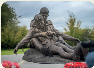
📍 The Memorial Brothers in Arms