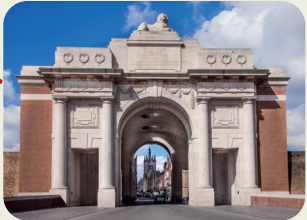
📍 The Menin Gate, memorial to 55,000 missing

Our famous trip to the WWI Battlefields and memorials of the Ypres Salient. An in-depth look into 4 years of war on the Western Front.