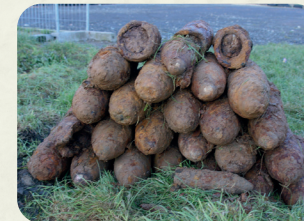
📍 Unearthed ammunition — the Iron Harvest

Sites visited may vary. It is possible to visit an ancestor's grave and to extend the trip to include the Last Post Ceremony. Private tours can also be booked in advance. Please ask well ahead for details and further information.